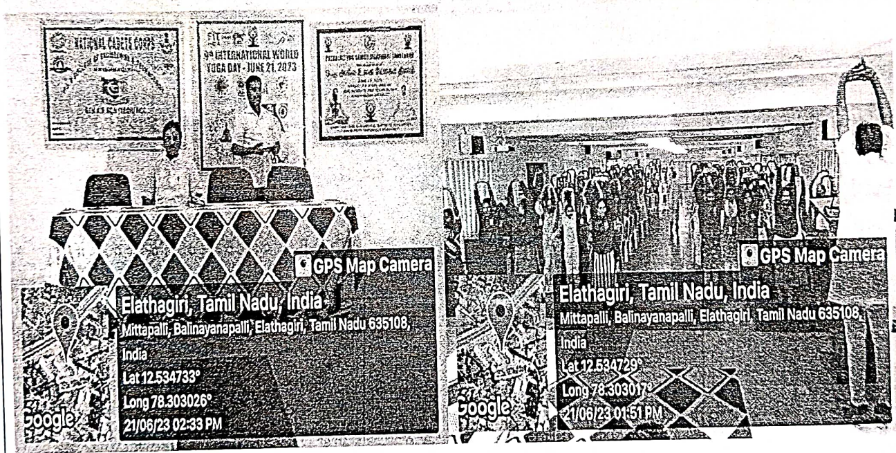
NCC Cadets are trained by Yoga master on International Yoga Day at PSVCET Auditorium on 21.06.2023