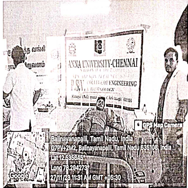
Students undergone Screening process and donated blood during “Blood Donation Camp” at PSV Multi Specialty Hospital, Krishnagiri on 27.11.2023